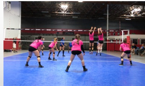
Highlights / game footage