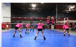
Highlights / game footage