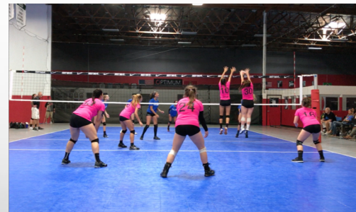
Highlights / game footage